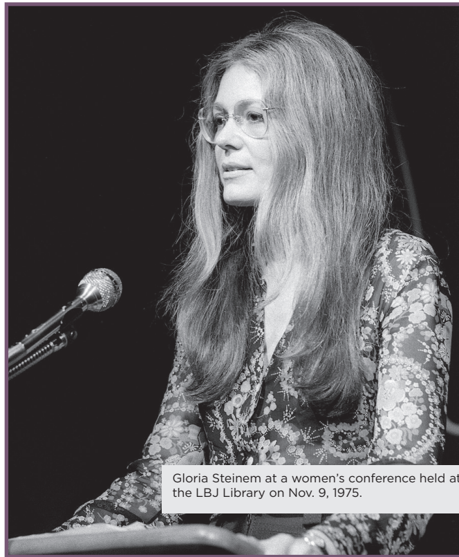
Gloria Steinem at a women's conference held at the LBJ Library on Nov. 9, 1975.