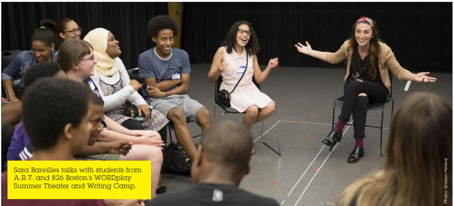
Sara Bareilles talks with students from A.R.T. and 826 Boston's WORDplay Summer Theater and Writing Camp.