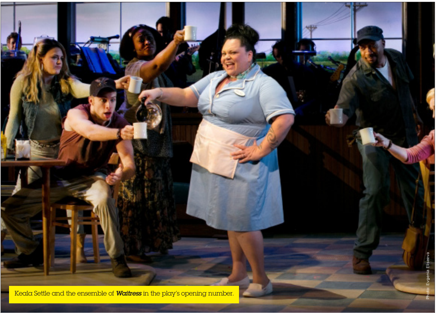
Keala Settle and the ensemble of Waitress in the play's opening number.